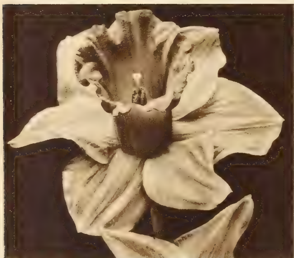
ALL YELLOW TRUMPET SINGLE DAFFODILS